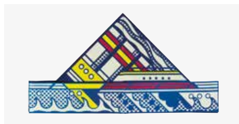
Roy Lichtenstein, Hat, 1968

In 1968, William Copley's SMS Portfolio imagined a new way of connecting artists' work with the public. Copley's seminal mail project, on show in its entirety for the first time in the UK, saw subscribers receive work by some of the most important artists of the 20th century, including Marcel Duchamp, Richard Hamilton, Roy Lichtenstein, Yoko Ono, Man Ray and many more.