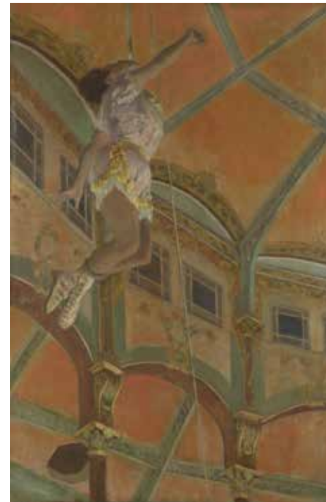
Hilaire-Germain-Edgar Degas. Miss La La at the Cirque Fernando. Bought, Courtauld Fund, 1925.

Subscribe at museums-sheffield.org.uk/mail