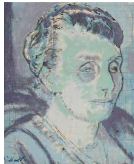
Walter Sickert, Portrait of a Woman , 1935

Kennard has gone on to become one of Britain's leading political artists whose work has come to define modern protest. His iconic, haunting images have appeared in publications such as New Scientist , The Guardian , New Statesmen and many more.