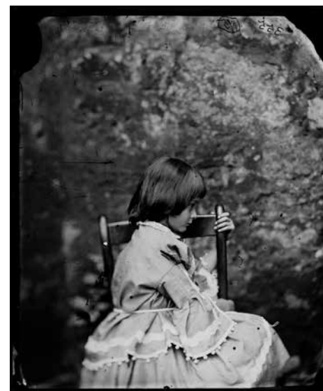
Lewis Carroll, Alice Liddell, 1858.