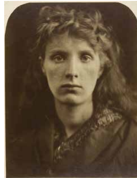
Julia Margaret Cameron, Mountain Nymph, Sweet Liberty, 1866.

Subscribe at museums-sheffield.org.uk/mail