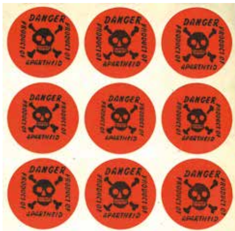
Anti-Apartheid stickers, 1980s.

This new exhibition marks the 50 th anniversary of the SMS portfolio's creation and the first time the portfolio has been shown in its entirety in the UK. Visitors will discover works by Marcel Duchamp, Roy Lichtenstein, Man Ray, Yoko Ono, Richard Hamilton and many more.