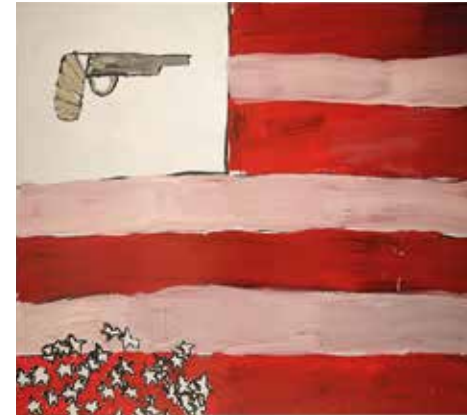
Sean Scully, Ghost, 2018 © the artist