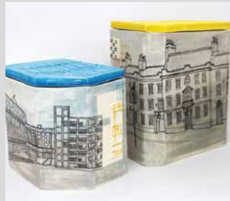
Meghan Downs, Sheffield Collection Boxes. Photo © the artist