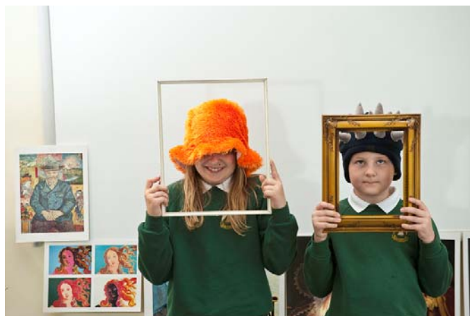
Local pupils get framed at the Graves Gallery

Highlights from 2009/10 include silver pieces and denim bags from the Design for Life project made by young people in Sheffield going on to be exhibited at the V&A London, a day of Patti Smith including an 'In conversation', a spine-tingling concert and a book signing, work from 40 Rotherham schools inspired by art works in the Graves Gallery going on display, a team of young curators working together to choose, interpret and display portraits of great writers from the National Portrait Gallery .