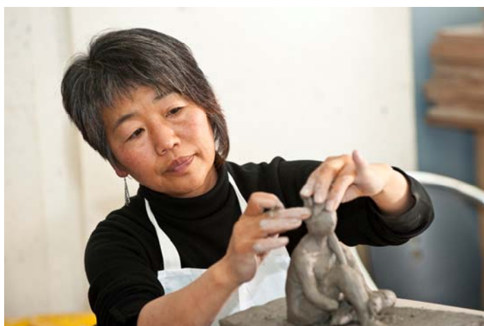
Clay Figure Sculpture class, Millennium Gallery

We have worked together with Every Sheffield Child Articulate and Literate to deliver training sessions for teachers and Early Year practitioners, delivered over 600 workshops for KS1-5 and hosted just under 400 self guided visits.