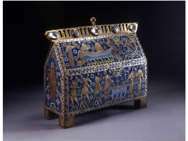
The Becket Casket, 1180-1190, a treasure from the V&A

Installations and original artist commissions, with support from Arts Council England, continued to animate and enrich the Millennium Gallery's main thoroughfare.