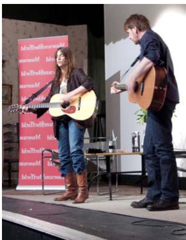
Patti Smith gives an impromptu performance at her book reading