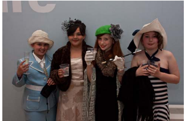
Happy 75 th Birthday to the Graves Gallery and Central Library

The year began with a party as the Graves Gallery and Central Library teamed up to celebrate the 75 th anniversary of the building. Alongside a programme of exhibitions and events which highlighted the history of the much-loved institution, a period dress birthday party proved to be the social event of the spring. The Graves Gallery has never looked better, however despite the DCMS Wolfson refurbishment programme, the building itself remains in need of fundamental upgrading if its future is to be secured.